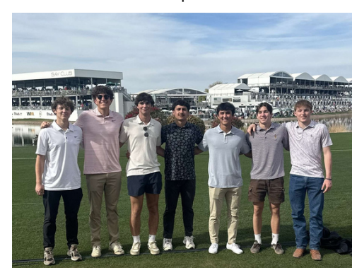
Pictured are brothers from Fall '24 PC

addition tο those who volunteered, many brothersboth collegiate and alumni-were in attendance, taking in the tournament's electrifying atmosphere. The Waste Management Phoenix Open is renowned for being one of the most entertaining stops on the PGA Tour, and brothers enjoyed only the high-level competition but also the unique and festive environment that sets this event apart from